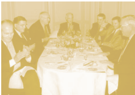
Prominent guests at the award ceremony.