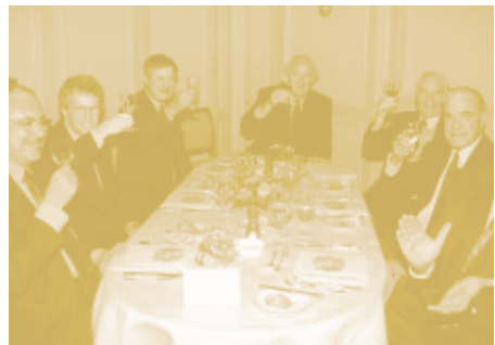
A toast to the winners of the SWISS BRIDGE AWARD 2003.